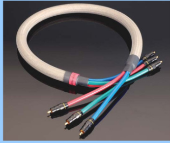
PREMIUM COMPONENT VIDEO