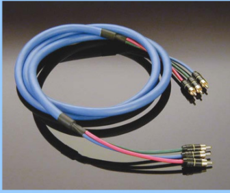
HIGH PERF. COMPONENT VIDEO