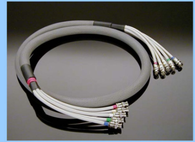
PREMIUM RGB VIDEO