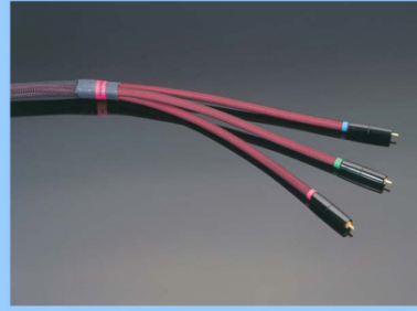
REFERENCE XL COMPONENT VIDEO