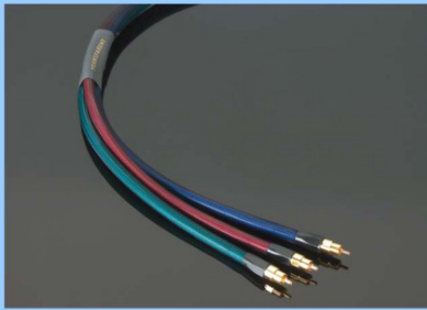
REFERENCE COMPONENT VIDEO